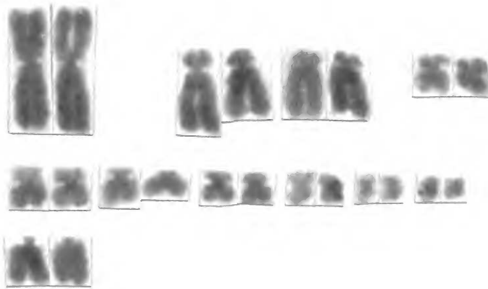
Figure 3. Karyotype of a female specimen of Carollia benkeithi , MVZ 136462.

Comparisons. —We provide comparisons of Carollia benkeithi with samples of C. castanea , within which it usually has been included (Pine 1972; Koopman 1993). In the absence of a more accurate understanding of the degree of variation within and among populations of C. castanea , we assume that populations from Costa Rica, where the type locality is located, are representatives of that species. However, a full review of the variation in this group of species is beyond the objectives of this study. When more voucher specimens are accompanied by sequence and chromosomal data, such analysis will provide the most powerful resolution.